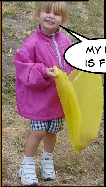
SERIOUS PICKING NOW UNDERWAY