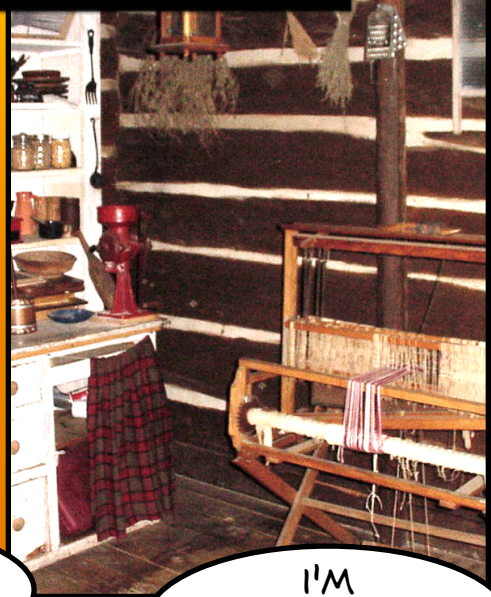
WHERE'S THE T.V.?